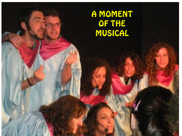
A MOMENT OF THE MUSICAL

On May 20, in the Sala Convegni del Palazzo del Municipio di Ribera, the students of the I.B.E.I. Italian Bible Institute conducted an outreach concert titled “One Way for Grace.” The theme was to emphasize God’s grace in a world full of tragedies, and to bring hope, courage and blessings.